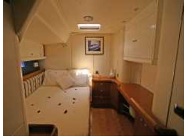
Double Guest SR