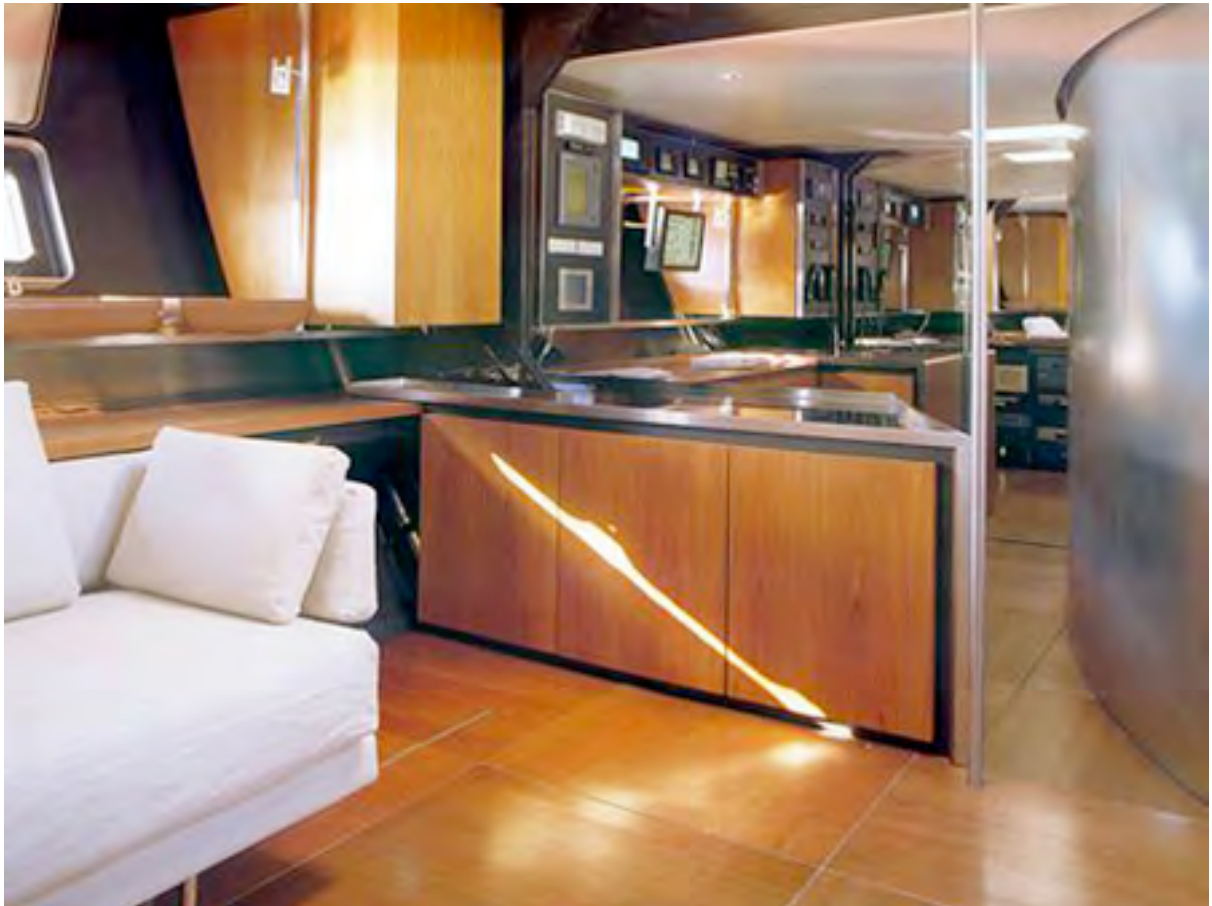
Saloon / Nav. Area

16 GR Market Place P.O. Box 90607 AMSC 1001 Auckland, NZL